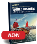
AMSCO® AP® World History: Modern