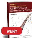
AMSCO® AP® United States Government & Politics, 3rd Edition