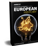
AMSCO® AP® European History