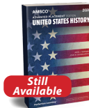
AMSCO® AP® United States History, 3rd Edition