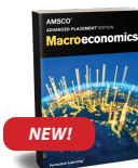
AMSCO® AP® Macroeconomics