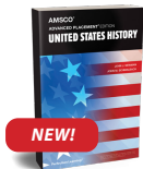
AMSCO® AP® United States History, 4th Edition

Order at perfectionlearning.com/ap-parent or call (800) 831-4190 (M–F, 7:30 a.m.–4:00 p.m. CST) to receive the BEST PRICE and MOST UP-TO-DATE AP® edition!